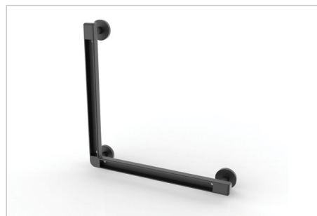
90 Degree L Grab Bar

Finish: Brushed Nickel 16" x 16" | 01LS16BN 24" x 24" | 01LS24BN