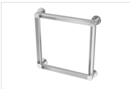
Square Bar Finish: Chrome 16" x 16" | 01SQ16PC 24" x 24" | 01SQ24PC