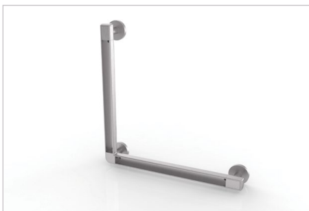
90 Degree L Grab Bar

Finish: Chrome 16" x 16" | 01LS16PC 24" x 24" | 01LS24PC