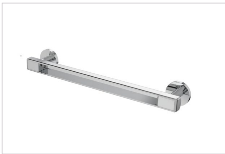
Straight Bar Finish: Chrome 16" | 01ST16PC 24" | 01ST24PC

Vibe offers a stunning array of three metal finishes , each tile-ready to give designers the freedom to customize look and finish with a surface inlay all their own. In parallel, LifeValet is preparing to introduce a range of elegant glass and metal inlays, each expertly crafted and exclusive to Vibe. No other grab bar offers this level of choice, or creativity.