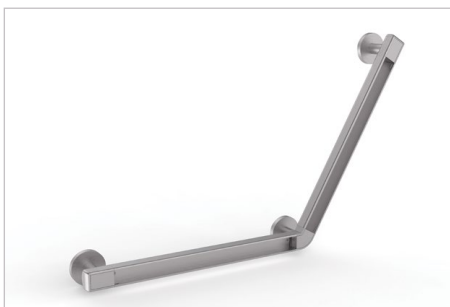
30 Degree Angled Grab Bar

Finish: Chrome 16" | 01AN16PC 24" | 01AN24PC