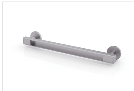
Straight Bar Finish: Brushed Nickel 16" | 01ST16BN 24" | 01ST24BN