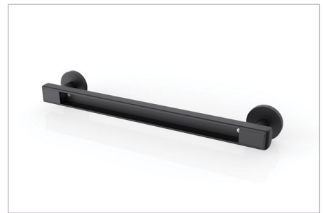
Straight Bar Finish: Matte Black 16" | 01ST16MB 24" | 01ST24MB