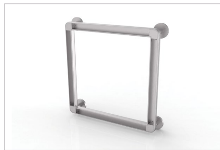
Square Bar Finish: Brushed Nickel 16" x 16" | 01SQ16BN 24" x 24" | 01SQ24BN