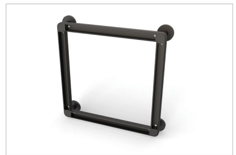
Square Bar Finish: Matte Black 16" x 16" | 01SQ16MB 24" x 24" | 01SQ24MB

***Our patent-pending Vibe tile-ready grab bars are sold as complete assemblies, including all necessary components for installation***