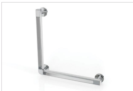
90 Degree L Grab Bar

Finish: Matte Black 16" | 01AN16MB 24" | 01AN24MB