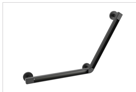
30 Degree Angled Grab Bar

Finish: Brushed Nickel 16" | 01AN16BN 24" | 01AN24BN