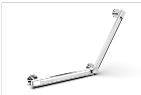
30 Degree Angled Grab Bar

Vibe's innovative modular design allows for customization beyond anything experienced before. Four stylish configurations, each available in two standard lengths with optional cornering hardware, easily connect to create any shape you can imagine, including unique and complex angles. Nothing is beyond possibility.